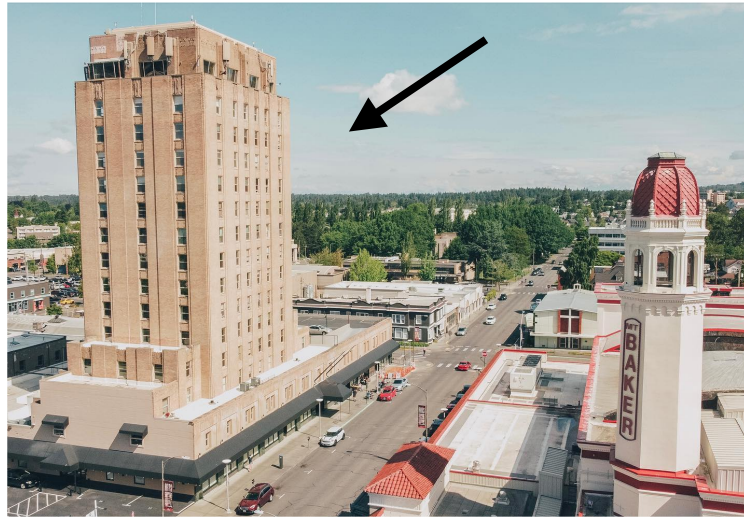
119 N. Commercial St., Bellingham Suite 490